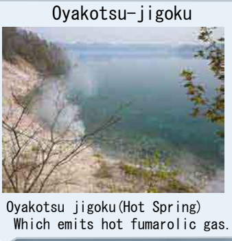
Oyakotsu-jigoku Oyakotsu jigoku (Hot Spring) Which emits hot fumarolic gas.